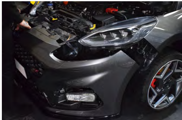
27. the bumper can now be removed.