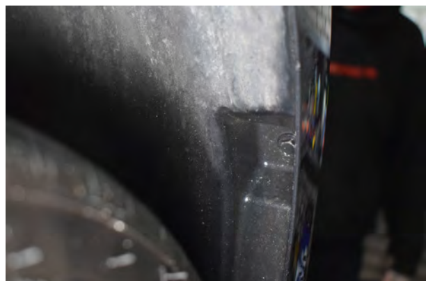
12. Remove the third bolt on the wheel arch liner.