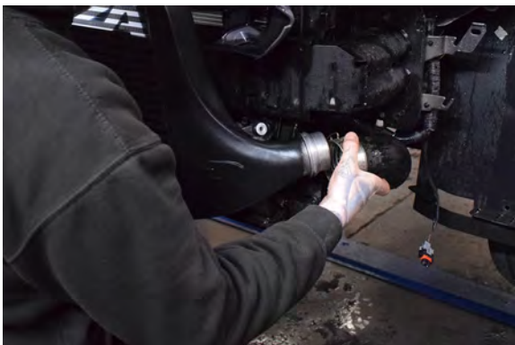
35. Lift the MVT Intercooler into position on the car.