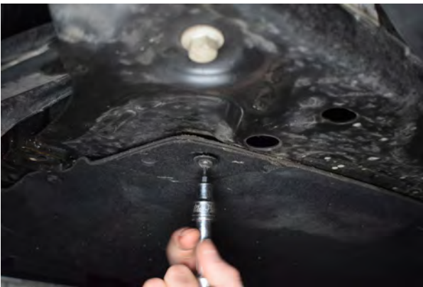
15. Step 14 continued.