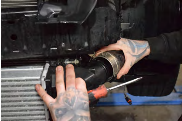
31. Remove the pipe from the intercooler. Repeat the last 3 steps on the other side.