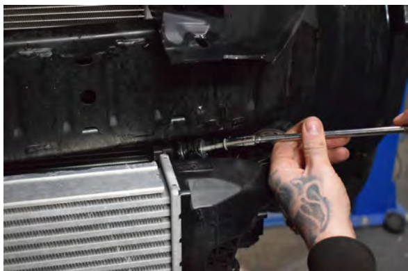
29. Remove the intercooler bolt.