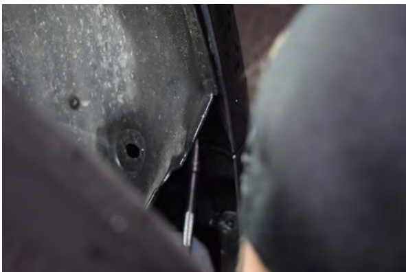
23. Step 22 continued.