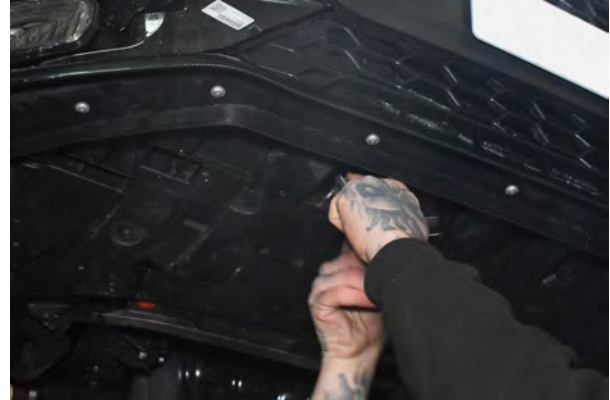
20. Step 19 continued.