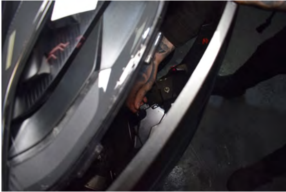
25. Before removing the bumper completely, unplug the fog lights and any electrical connections.