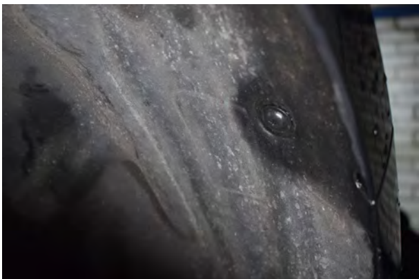
11. There is also a screw to remove on the wheel arch liner.