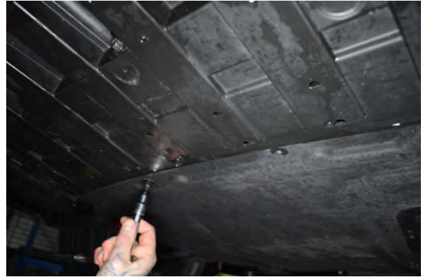
14. Remove all the under tray bolts.