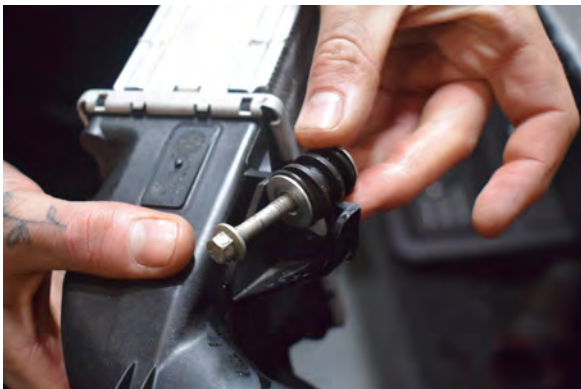
33. Remove the rubber mounting grommet from the standard intercooler.