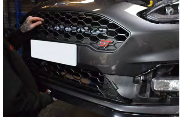
38. Lift the bumper back into position and reverse all the removal steps to complete the installation.