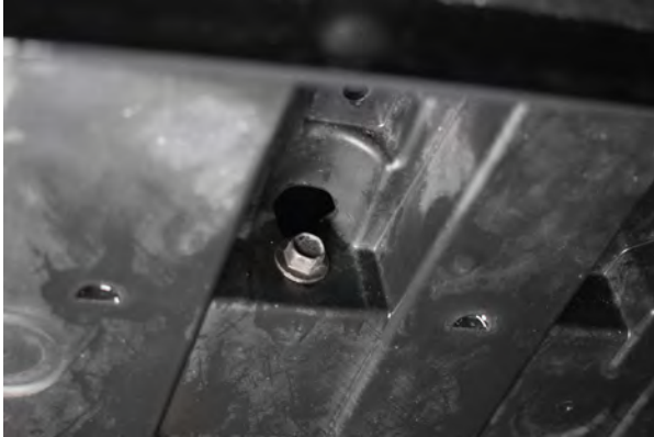
19. Remove all the bolts across the bottom of the bumper.