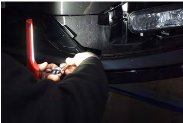
9. Step 8 continued.