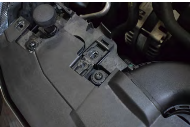
5. Step 3 continued.