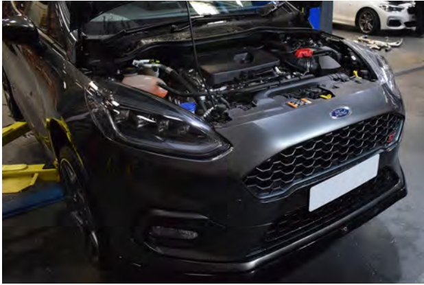
1. Raise the car on a ramp or Jack/Stand.