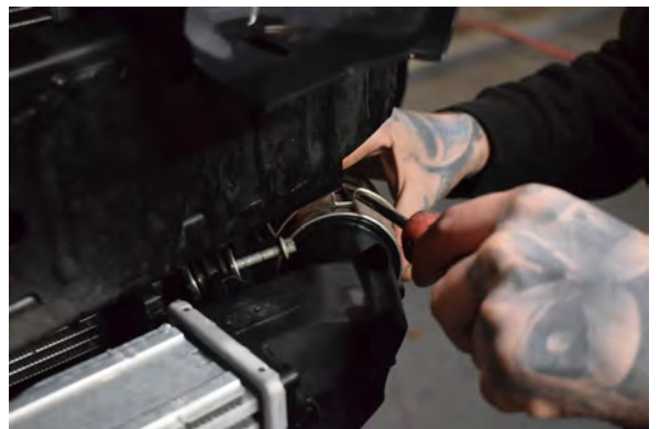
30. Use a screwdriver to prise the securing clip on the intercooler pipe.