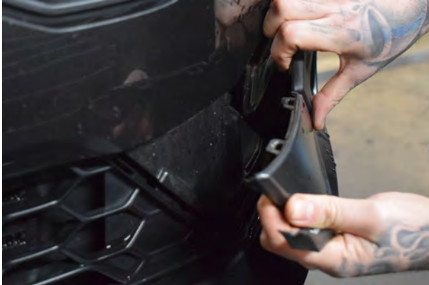
7. Step 6 continued.