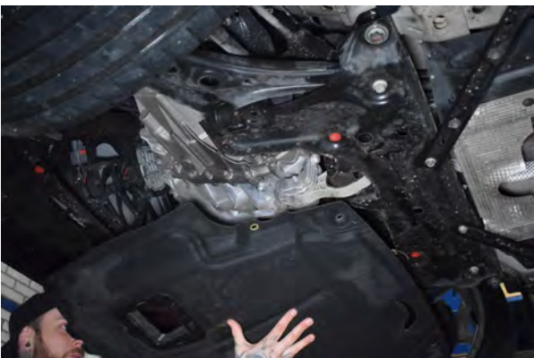
17. The under tray can then be removed.