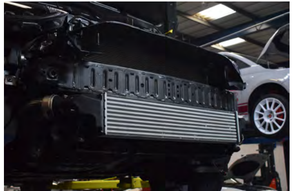
28. The intercooler is secured using just 2 bolts located in the top corners.