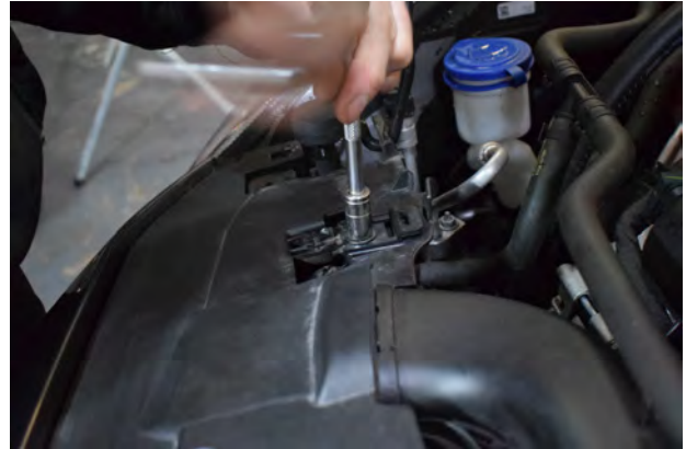
4. Step 3 continued.