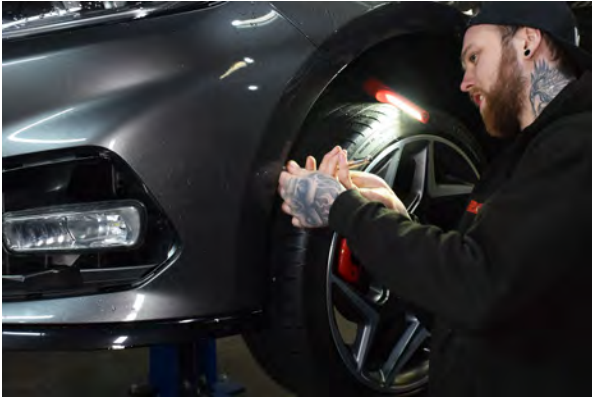
13. Remove all the wheel arch liner securing hardware on the other side,.