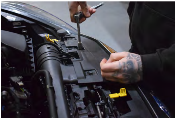
3. Remove 5x bolts across the top of the bumper.