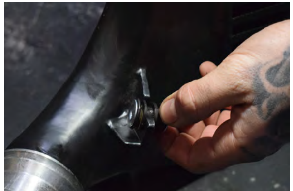
34. Transfer the grommet over to the MVT Intercooler.