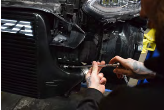
37. Install the 2x Intercooler mounting bolts.