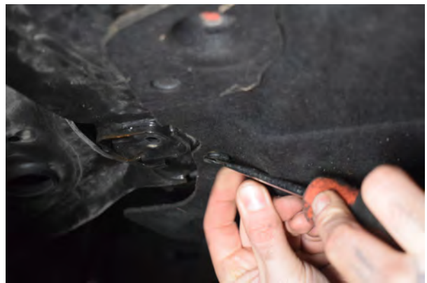
16. Also remove the plastic clips on the under tray.