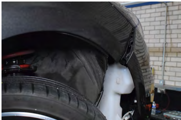
24. The edge of the bumper can then be pulled away.