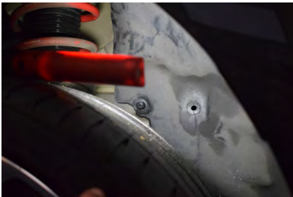
21. Remove a further 2x screws inside the arch. repeat on the other side.