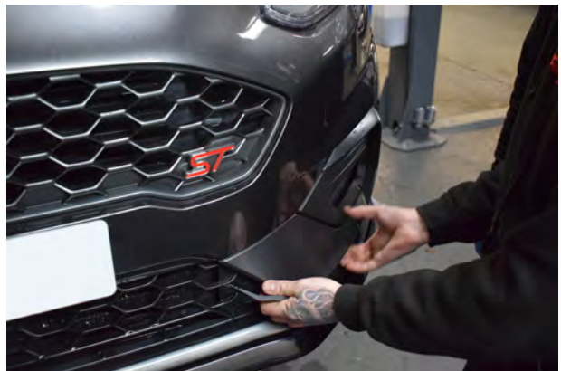
6. Pull away the lower bumper trim & repeat on the other side.