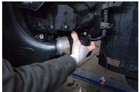
36. Push the intercooler inlet into the boost pipe. You will hear an audible click as the clip snaps into position and locks.