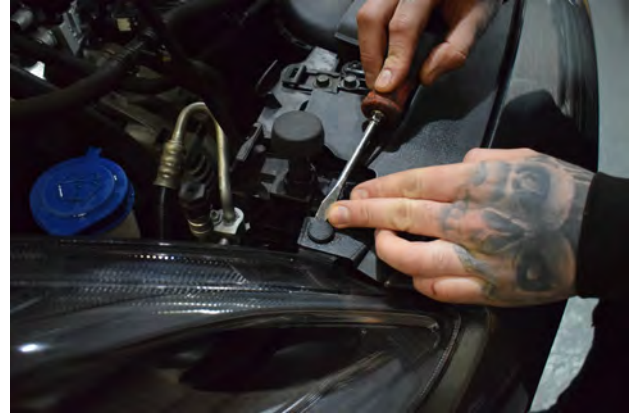
2. Use a screwdriver or trim tool to remove the clips on the top corners of the bumper.