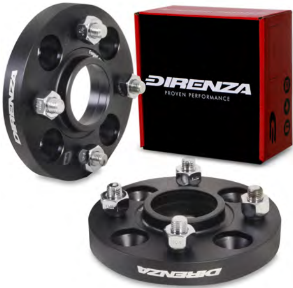
Ford Fiesta MK8 ST 20mm Wheel Spacers