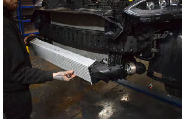
32. The intercooler can now be removed from the car.