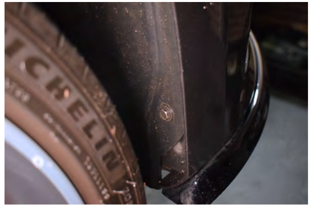
10. Remove the bolt on the lower edge of the inner wheel arch.