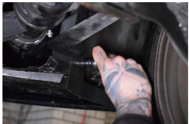
18. Remove the bumper fixing bolt located behind the wheel, repeat on both sides.