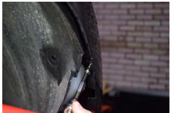
22. Peel back the arch liner and remove 2x bumper fixing bolts.