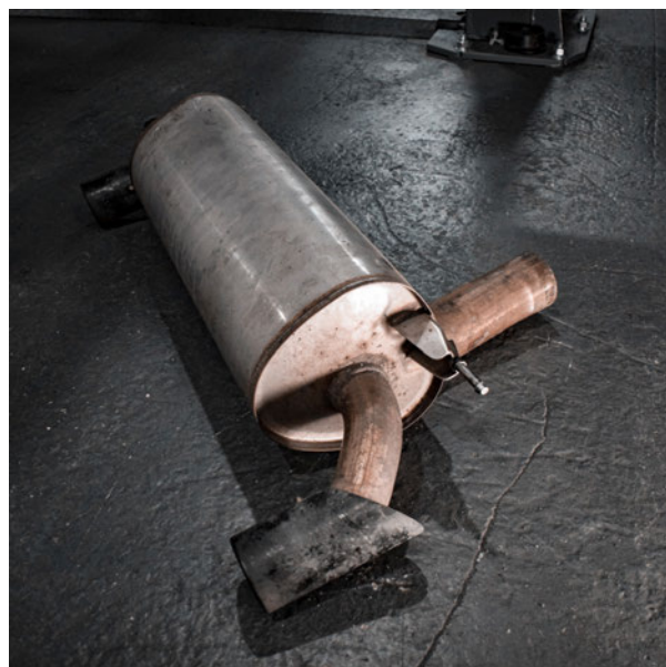
4. Ensure the cut you make is as parallel as possible.