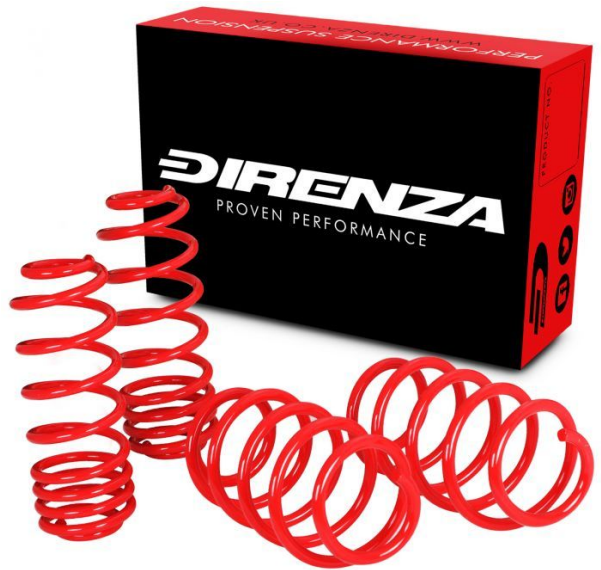
BMW F20 M135i 20mm/30mm Lowering Springs DIRSP-03367.