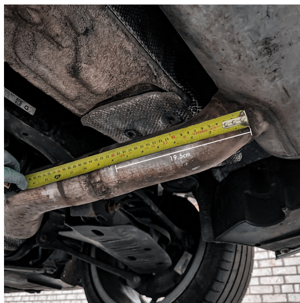
2. Measure 19.5cm away from the backbox, as shown above. Final position may vary \pm 0.5 cm.