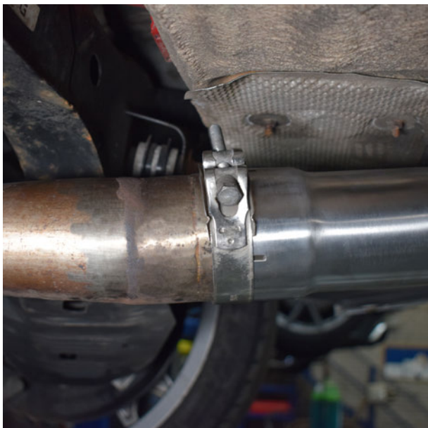
9. Tighten the clamp using a 13mm socket