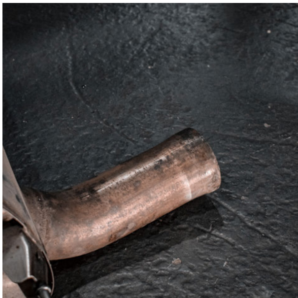
5. Step 4 continued.