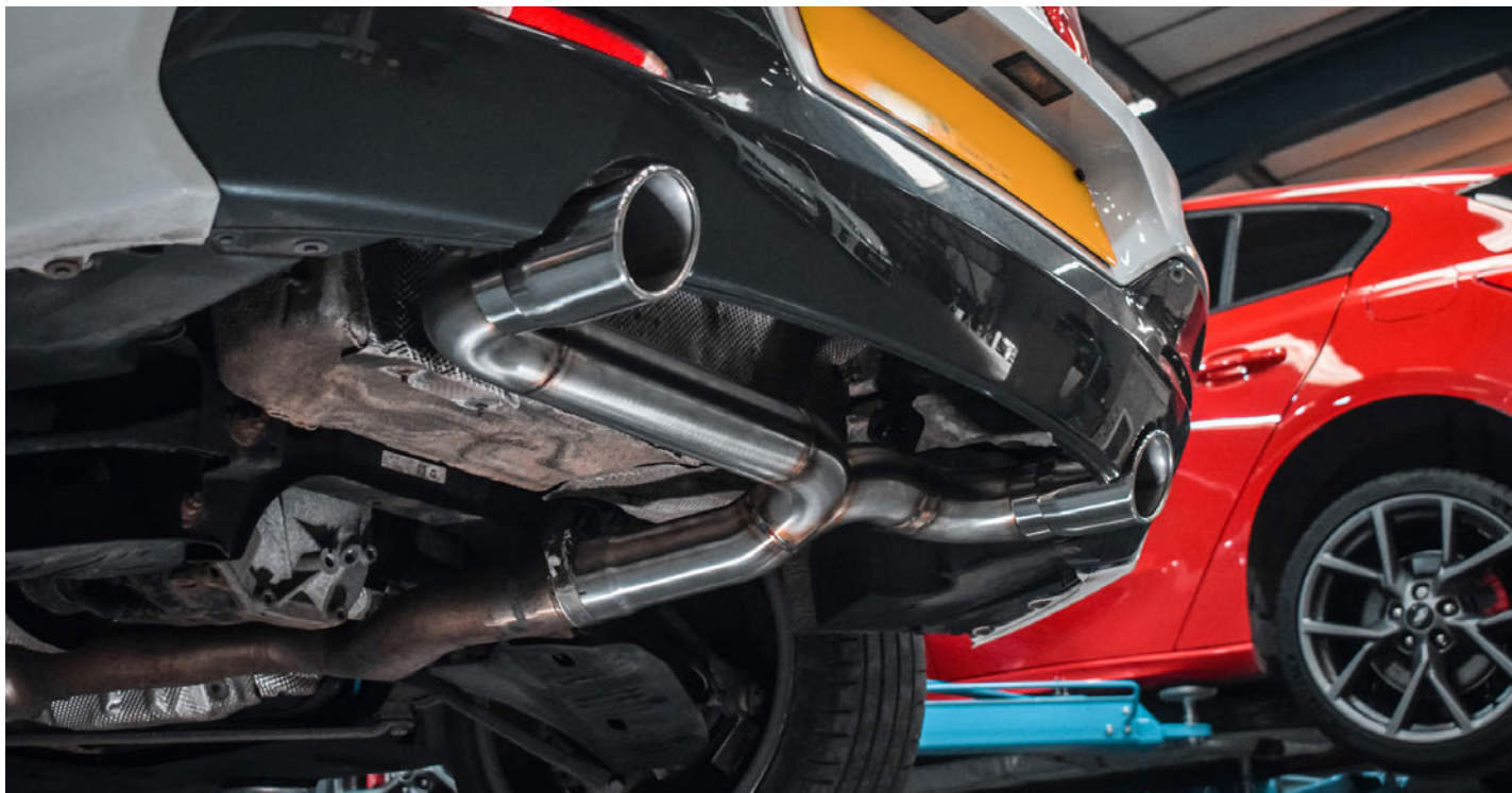
11. You have now successfully installed your Direnza Performance Backbox Delete.