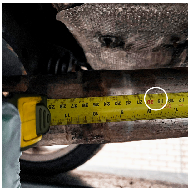
3. This point will be where the exhaust needs cutting.