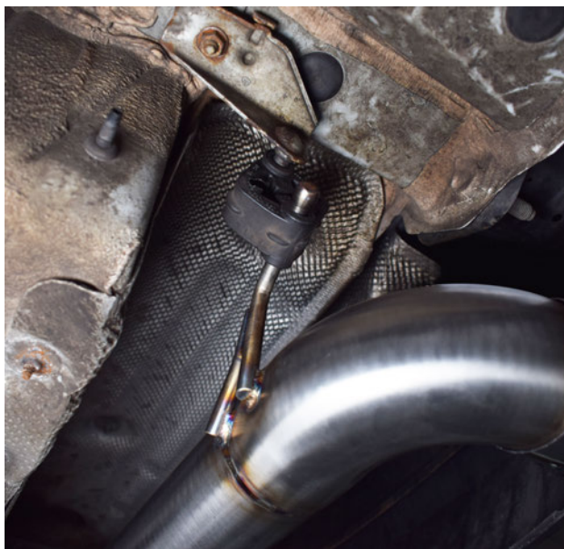
6. The Direnza Backbox can now be lifted into position and installed on the hangers.