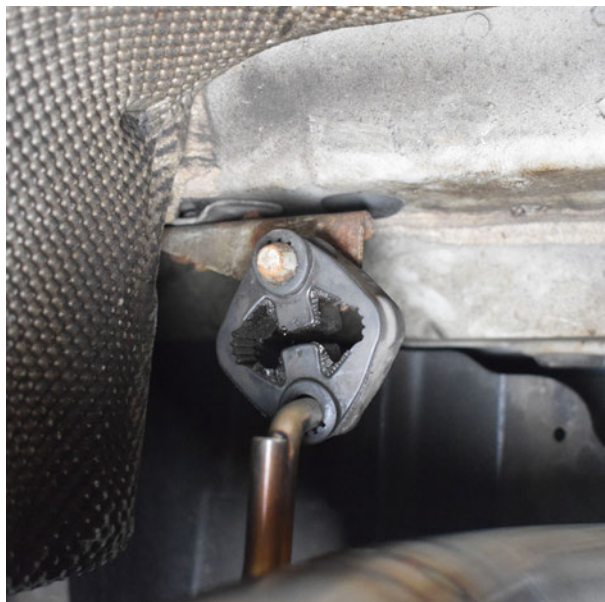
7. Step 6 continued.