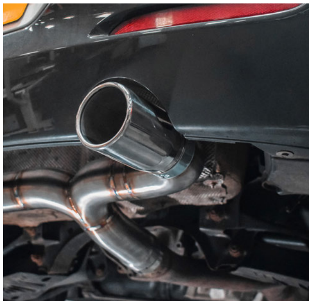
10. Install the tips using supplied clamps and 13mm socket.