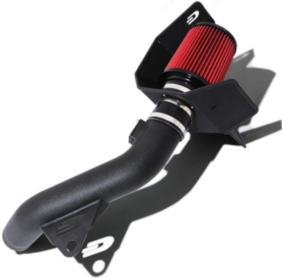
BMW F20 M135i Cold Air Induction Kit DZAK018.