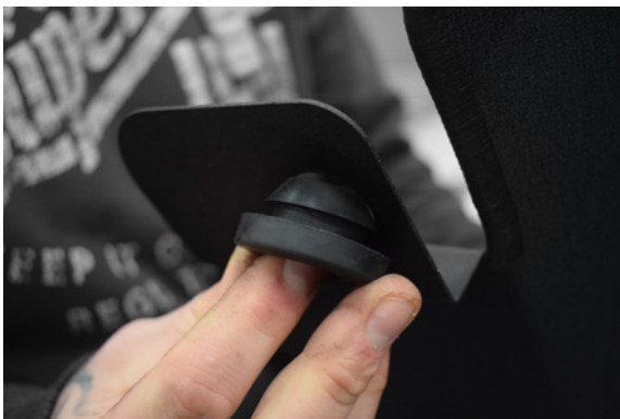
9. Insert rubber bobbins into the Direccion airbox/heat shield.