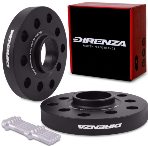
VW Golf 5x112 20mm Wheel Spacers