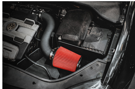
24. Your Induction Kit is now installed.