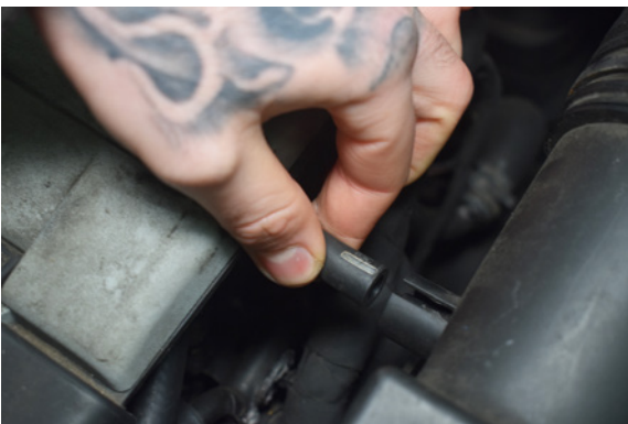
5. Remove vacuum pipe from intake pipe.