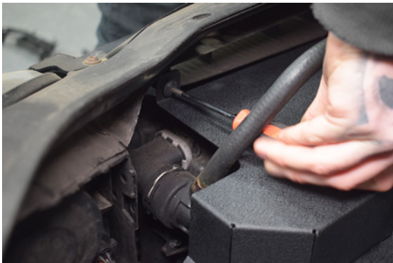
15. Secure using 2x T25 screws.