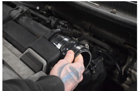
16. Fit the silicone to the inlet pipe with 2x jubilee clips.