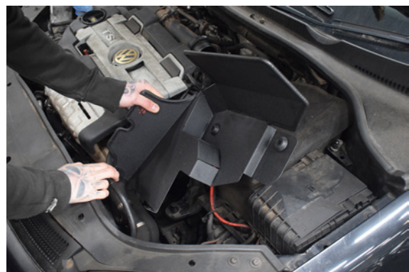
12. Lift the Air Filter housing into position.