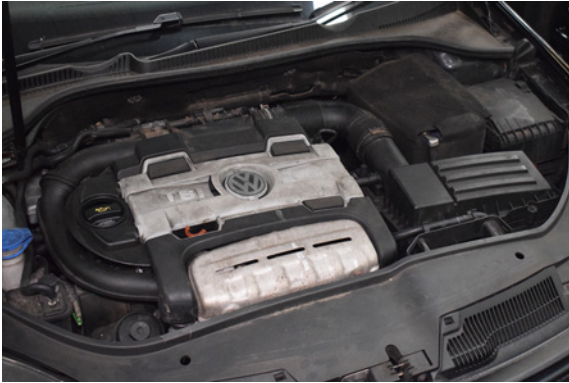
1. Open the bonnet.