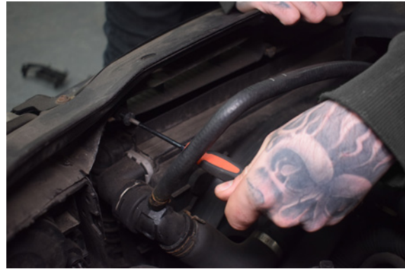
8. Remove 2x T25 screws and remove trim.