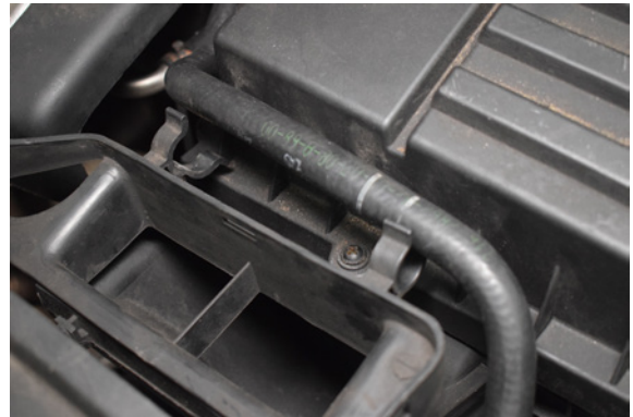
4. Remove vacuum pipe from clips.