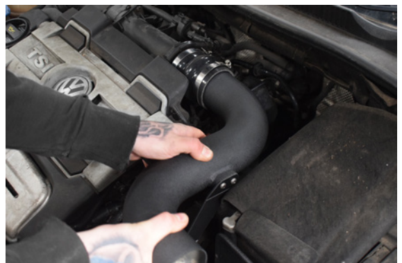
18. Place the hard pipe into position.