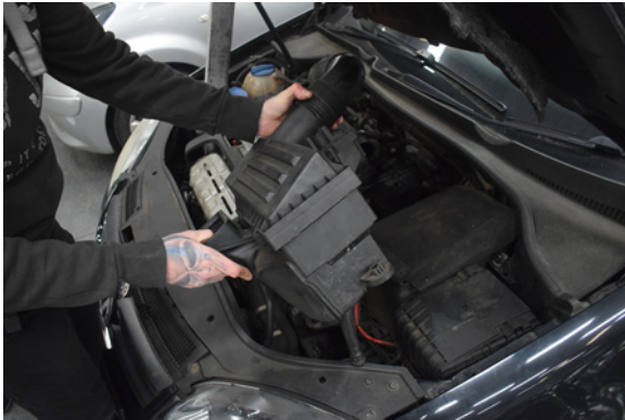
7. Pull up and remove the entire air box assembly.