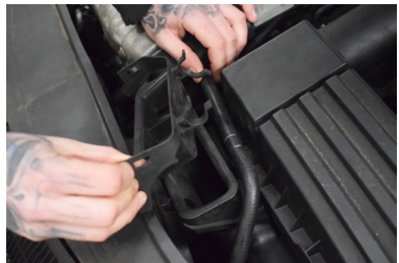
6. Remove the plastic trim.