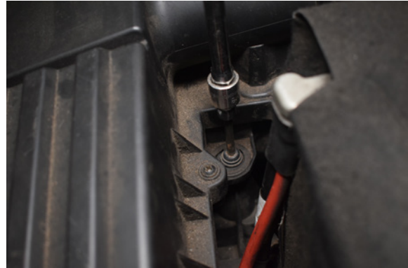
2. Undo the 5mm allen screw.