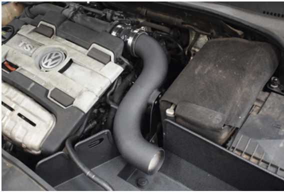
19. Step 18 continued.