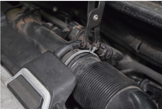
3. Remove the intake hose spring clip.