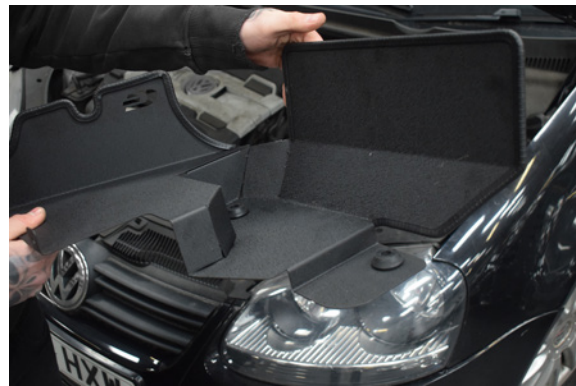
10. Step 8 continued.