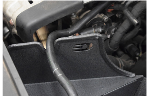
14. Ensure pipe sits in the slot in the Air Filter housing.