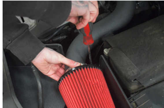
22. Secure to the hard pipe by tightening the jubilee clip.