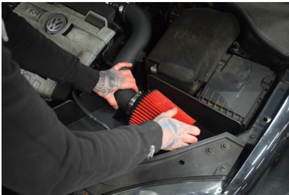
21. Fit Air Filter onto the end of the hard pipe.