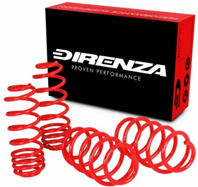
VW Golf MK5 1.4 1.6 40mm Lowering Springs.