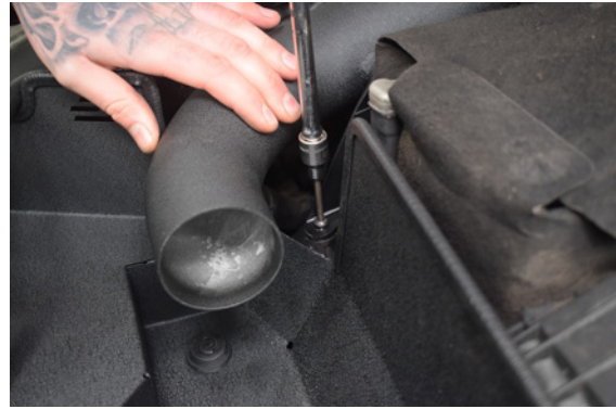
20. Secure hard pipe bracket to the car using 5mm allen key.