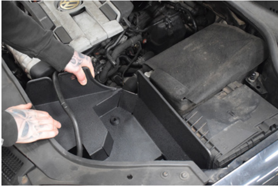
13. Place onto OEM lugs and push into position.