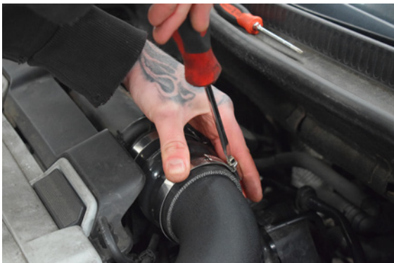
23. Tighten 2x jubilee clips securing the hard pipe to the OEM inlet pipe.