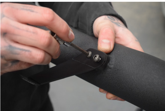
17. Mount the bracket to the hard pipe.