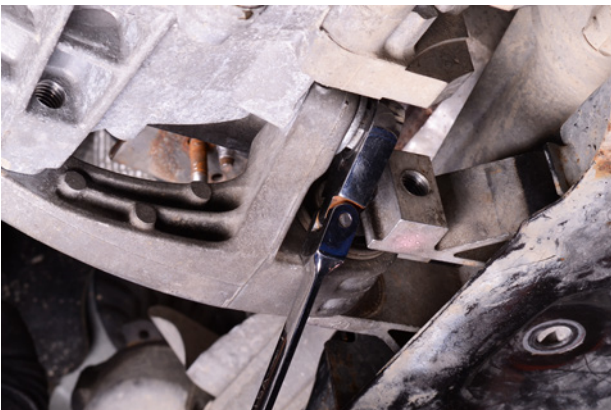
11. Remove the second dogleg mount bolt.