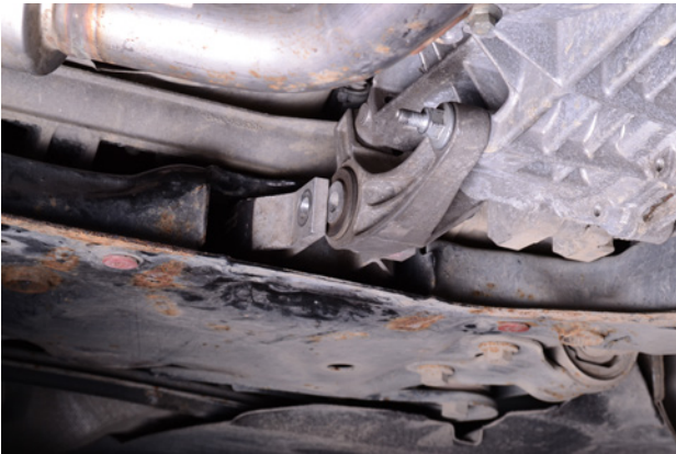
9. You can now access the bolt securing the dogleg mount to the gearbox.