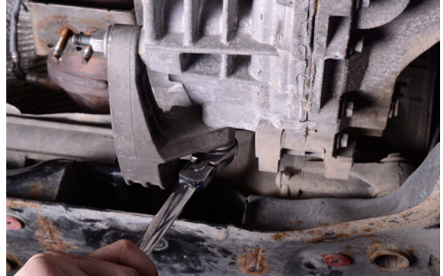
20. Step 19 continued.