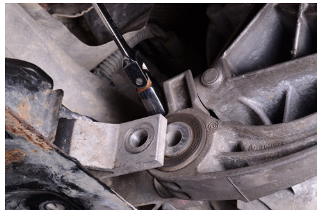
12. Remove the third dogleg mount bolt.