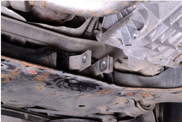
13. The Gearbox link mount can now be removed.