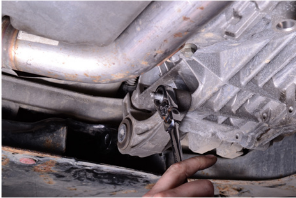
19. Once all three dogleg mount bolt have been started by hand you can tighten.