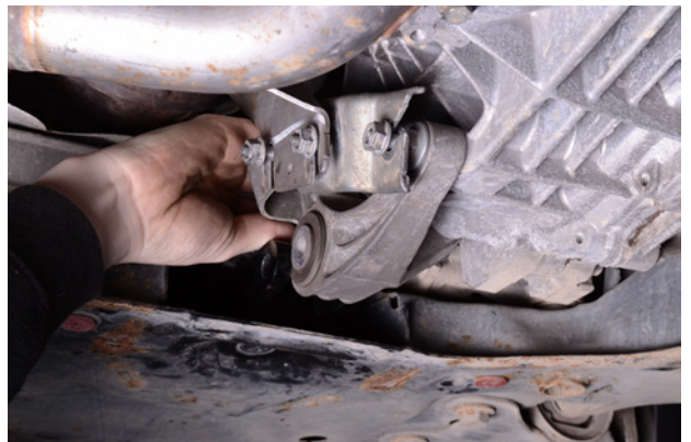
24. Hand tighten 3x nuts securing the bracket to the studs.