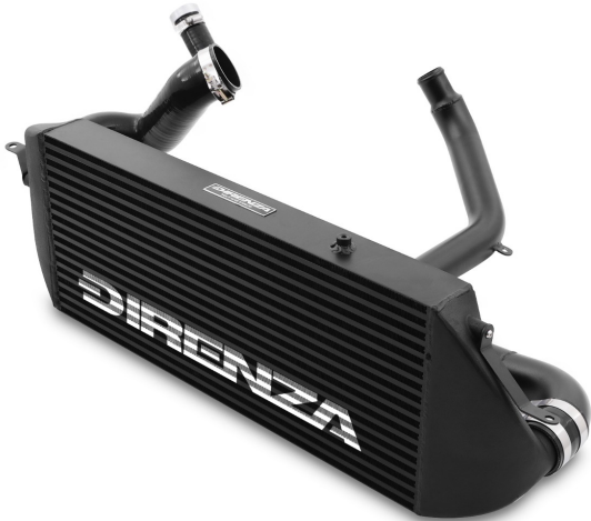
Ford Focus MK2 ST225 MVT Intercooler.