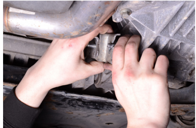
8. Pull away the exhaust bracket.