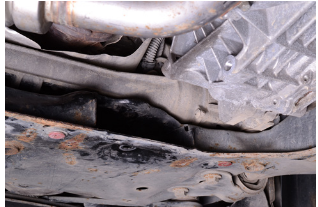
14. Remove the Gearbox link mount.