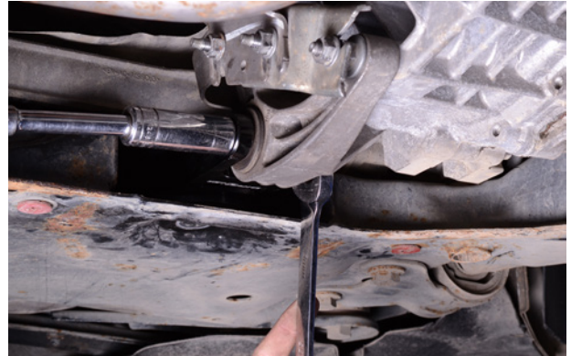
28. Tighten the bolt, securing the dogleg mount o the Direnza link mount.