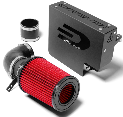
Ford Focus MK2 ST225 Air Induction Kit.