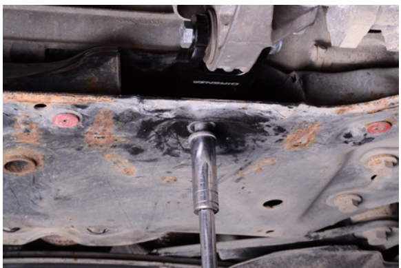
29. Installthe bolt securing the link mount to the subframe and tighten.