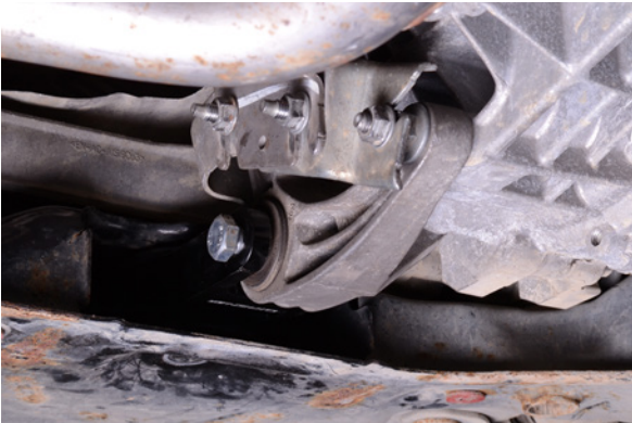
27. Once tight, you can position the Direnza gearbox link mount either side of the dogleg mount bush and insert bolt.