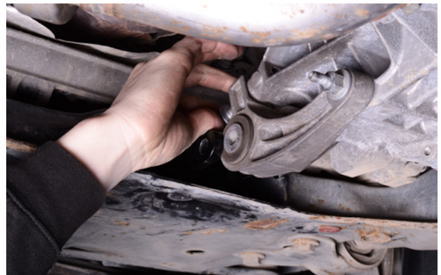
18. Hand tighten third dogleg mount bolt.