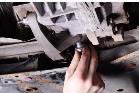
17. Hand tighten the second dogleg mount bolt.