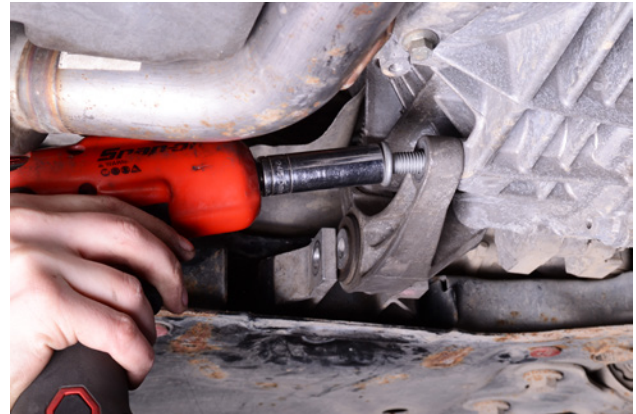
10. Remove the bolt.