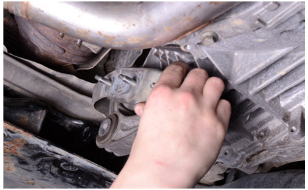
22. Re-install the bracket.