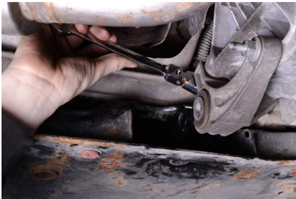
21. Step 19 continued.