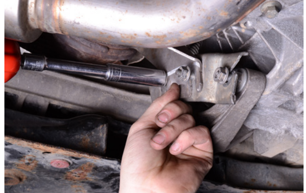
26. You can now tighten the 3x nuts for the support bracket.