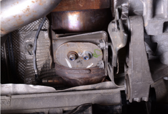
25. Tighten the two nuts on the upper spacer/bracket.