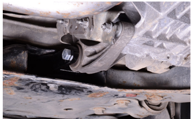
30. The Direnza Performance Gearbox Mount is now installed.