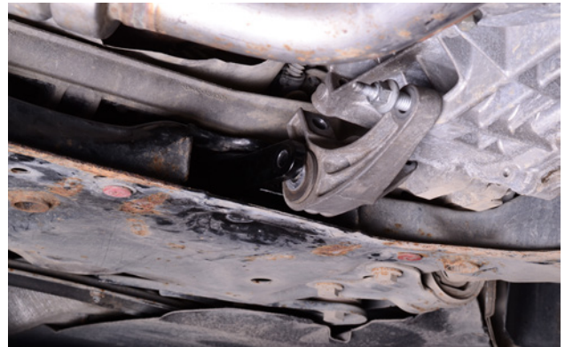
16. Reinsert dogleg mount into position and hand tighten the further most forward bolt. Securing it to the gearbox.