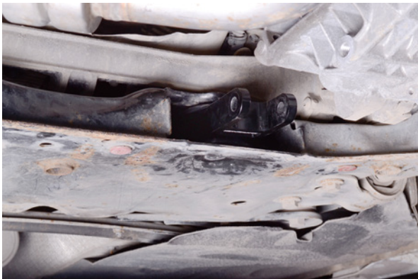
15. You can now place the Direnza gearbox mount into position.