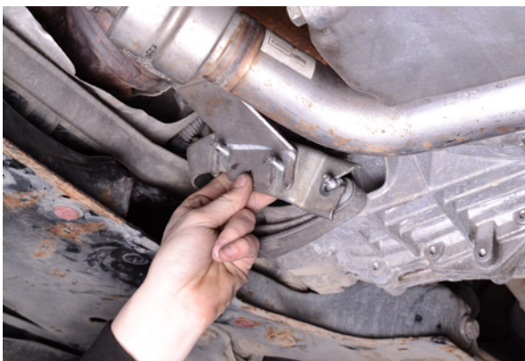
23. Then re-install the exhaust support bracket.